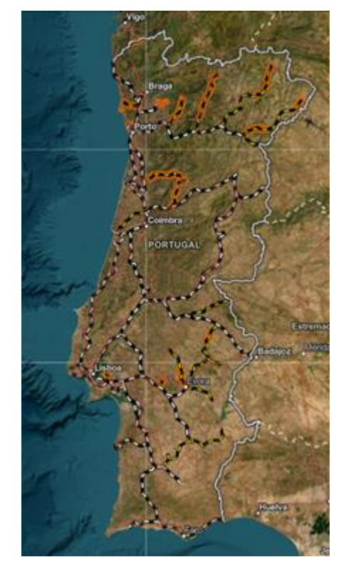
Figure 1. Map of Ecopistas Portuguesas

lengths vary from 3.100 km (Maia Greenway with the shortest length) to 76.800 km (Vouga Greenway with the longest length).