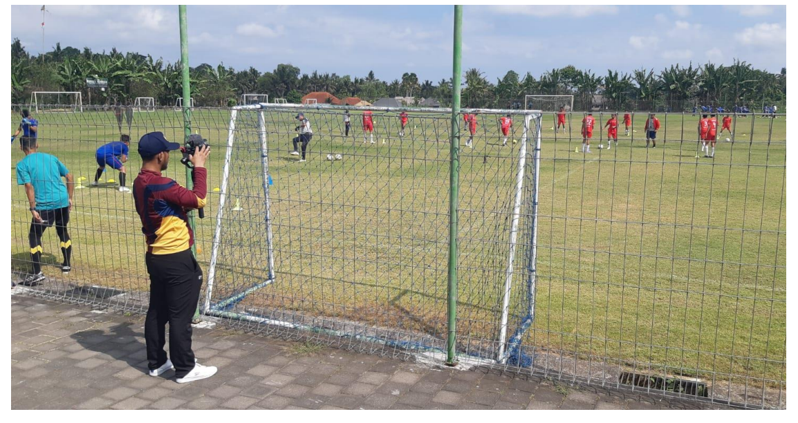
Figure 3. Football field facilities for Padangtegal Traditional Village residents around the Monkey Forest Tourism Destination area