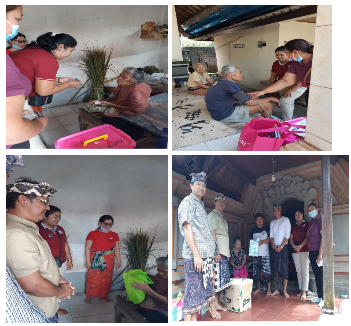
Figure 2. Health assistance to older people provided by Baga Pawongan Padangtegal Traditional Village

health assistance activities. Health assistance is carried out through health checks, drug/vitamin assistance, and assistance for health equipment for older people, such as diapers and wheelchairs, if needed.