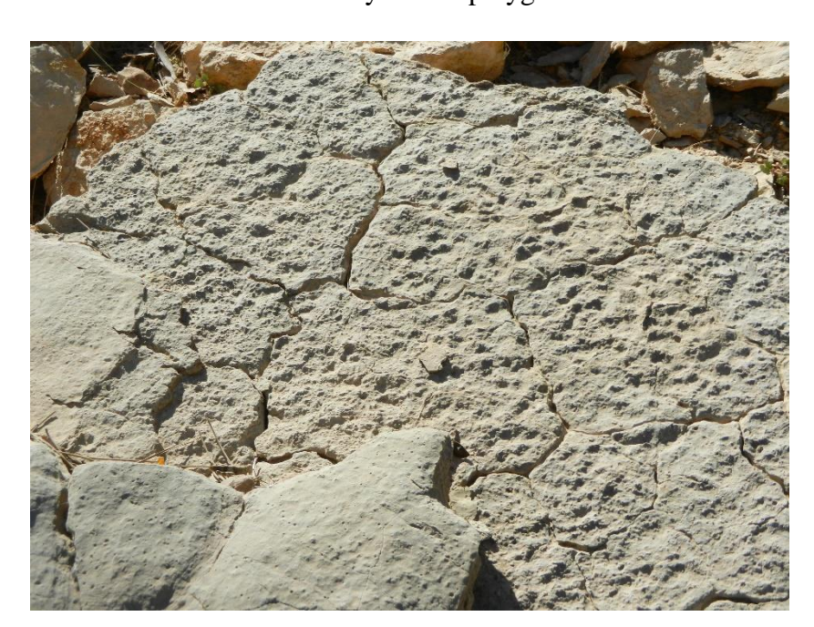
Figure 1. Surface of a limestone layer with polygonal cracks and small holes.

At a place on the wayside of the road between the Guadalquivir River source and Puerto Llano, a bright limestone layer with approximately polygonal cracks and small holes at the surface is exposed (figure 1). The question which could be asked to the group is: What was the origin of these structures in the sediment?