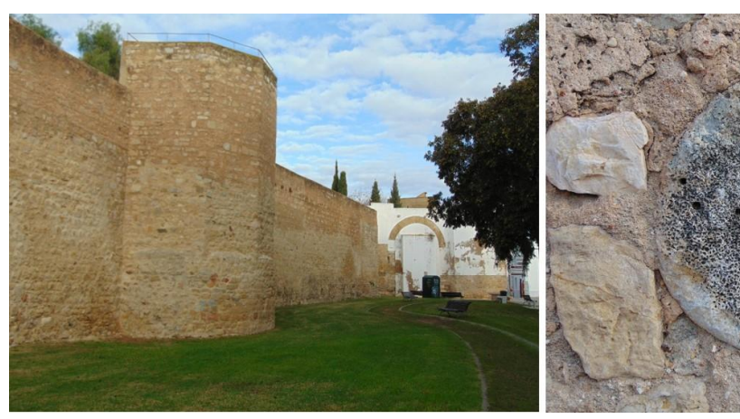
Figure 5. Left: Part of the ramparts of Faro. Right: Round marble stone incorporated in the ramparts of Faro.

As materials for the construction of the ramparts, mainly stones with their origin in the area of Faro were used. In some places, building stones from other places can be found, which had to be transported over long distance, or arrived as ballast stones of ships which docked in Faro. But there are some quite perfectly round stones made of marble in the ramparts (figure 5) and in the gate of Arco da Vila, whose shape seems not to have a natural origin. What might have been the cause of these stone's form? Were they fragments of a Viking's football? Or cannonballs which got stuck in the stone wall and broke afterwards?