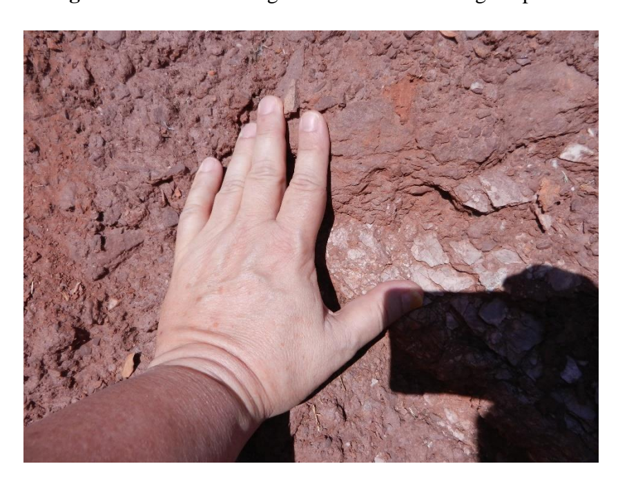
Figure 4. Pirineo. Putting the hand onto the Pangean plain.

In another place, at Pirineo (north of Querença, in the county of Loulé), the same structure appears at a distance of about 90 km from Telheiro Beach in a road embankment. Here, one's hand can be put onto the division line that corresponds to the Pangean plain as it existed before the deposition of the sandy material, covering a gap in sedimentation of several tens of million years (figure 4).