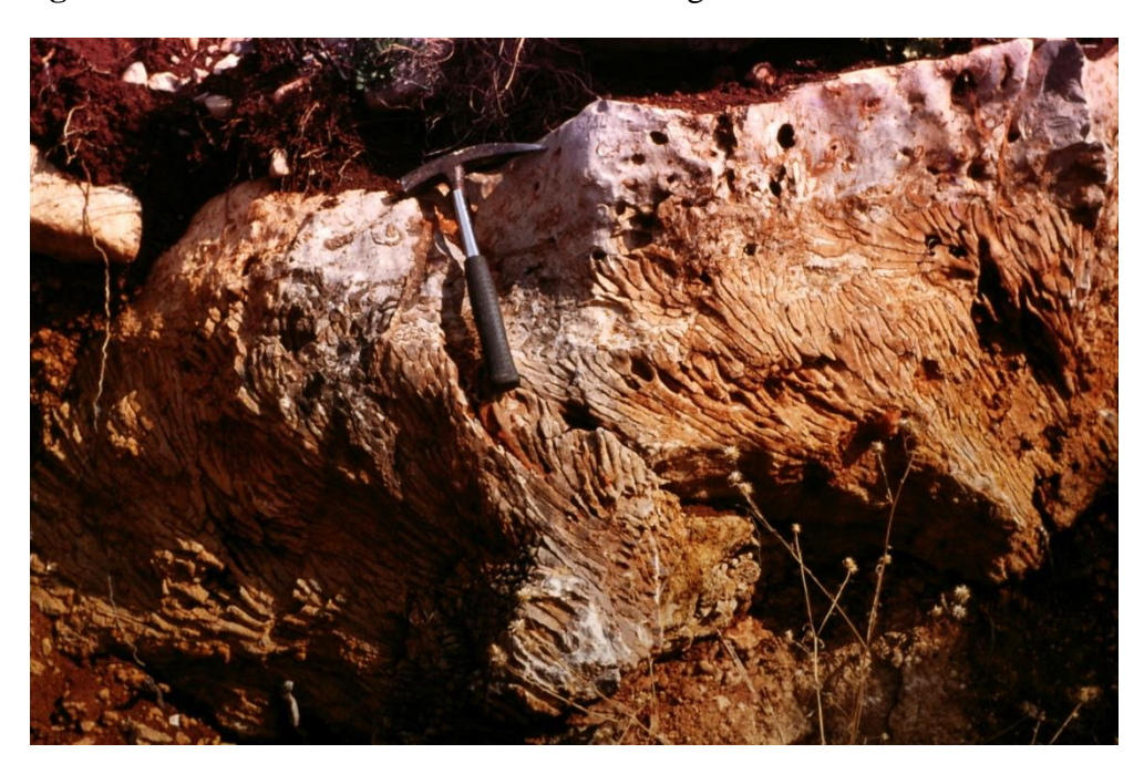
Figure 2. Limestone with fossil "bushes" at Lagoa dos Cavalos/Cerro Grande.

In the southwest of Santa Catarina da Fonte do Bispo, at a distance of about 3 km from this place, a limestone layer of Kimmeridgian (Upper Jurassic) age, which was deposited about 155 million years before (International Commission on Stratigraphy, 2018), shows some strange structures (figure 2). They seem to be rests of bushes, which have been cut at their upper part in a nearly straight level. Would it be possible that these "bushes" were grazed by dinosaurs, which caused this line?