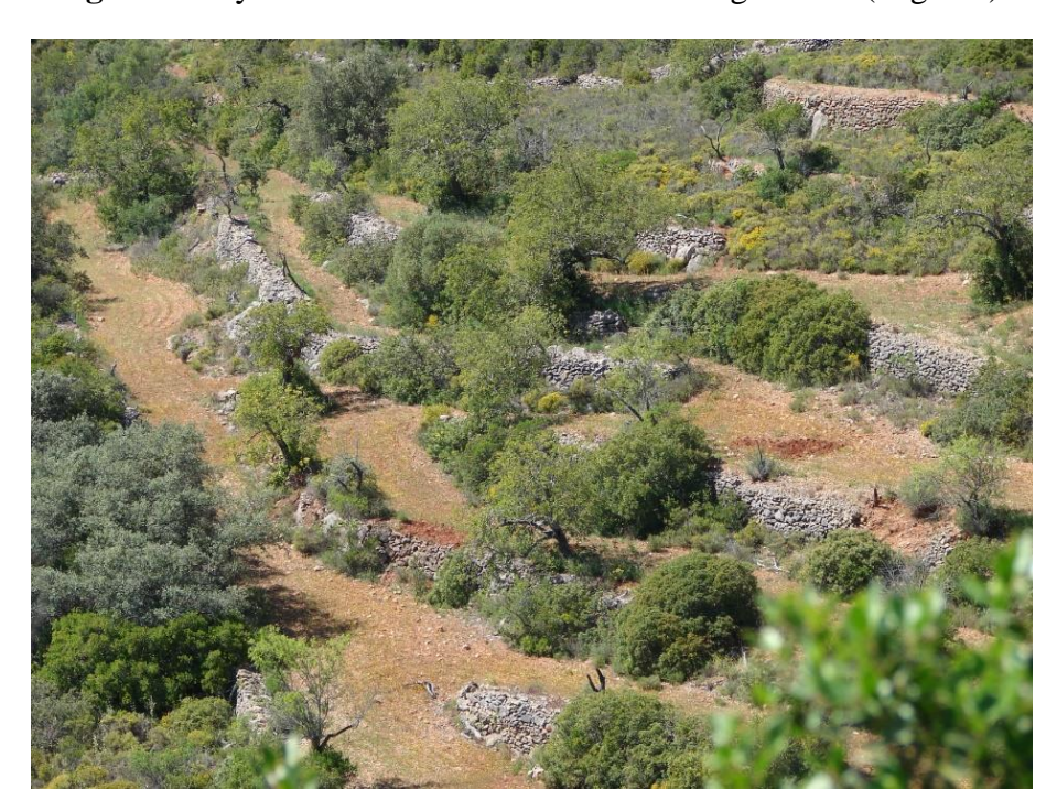
Figure 6. Drystone Walls in the west of São Miguel Hill (Algarve).

The figure 6 displays a part of an area in the west of the São Miguel Hill in Algarve, where drystone walls dominate the landscape. However, their spatial distribution does not follow continuously the height lines as in many other areas (Balsells et al., 2019; Gonçalves, Pérez Cano, & Prates, 2019), it shows interruptions and several courses which are oblique to the slope, in an apparently disordered way. Why did the rural worker choose this design for their drystone walls?